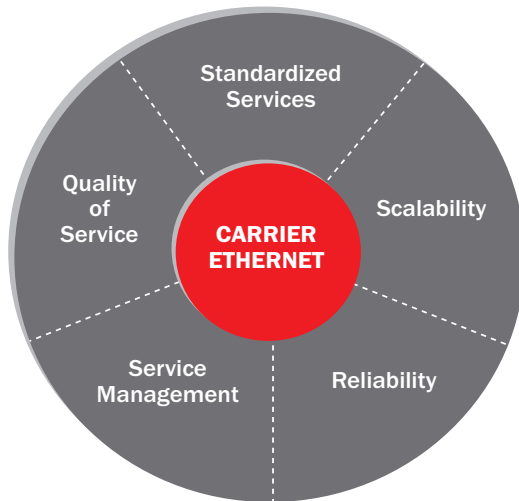
Figure 1. The five attributes of Carrier Ethernet.

Carrier Ethernet has five attributes, shown in Figure 1 and described in this section.